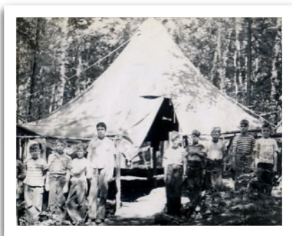
Early campers still like to say “We stayed in tents!”

Plans are well underway for our 75th season, and we can’t wait for 2021! God has given us the great privilege of ministering to thousands of campers of all ages over the past 75 years, and we have seen many lives changed by the Gospel. We are excited to see what He has in store during the next 75 years!