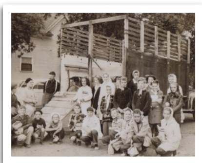
Possibly the first “bus” trip to camp.

We look forward to sharing more 75th year Camp Zion stories over the next year, and would love to hear from you about your memories!